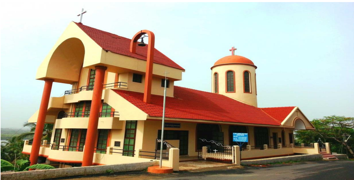
St. Mary’s Church, Ribandar, Goa where the Holy Relics of Mar Yulios are reverently preserved.