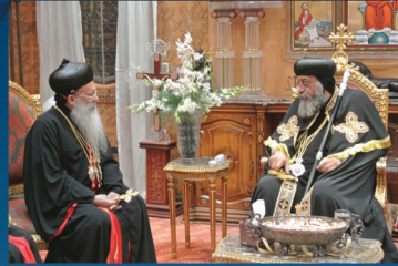
Coptic Orthodox Pope H.H. Tawadros II