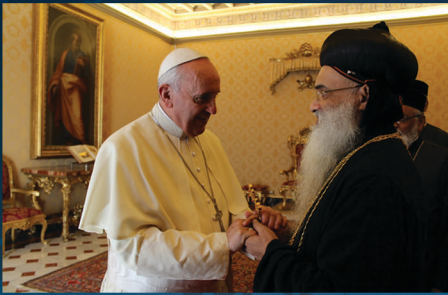
Roman Catholic Pope H.H. Francis I