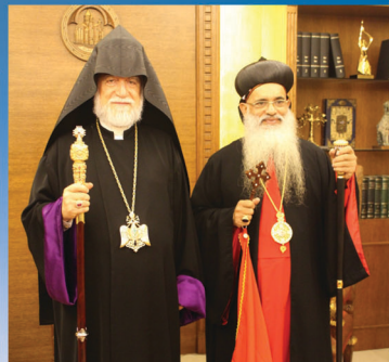
H.H. Aram I, Catholicos of the Great House of Cilicia