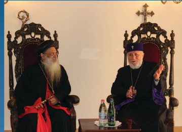
H.H. Karekin II, Supreme Patriarch and Catholicos of All Armenians