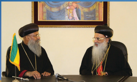
Patriarch of Ethiopian Orthodox Tewahedo H.H. Abune Mathias