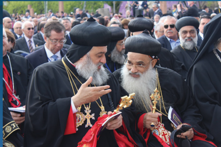
Patriarch of the Syriac Orthodox H.H. Ignatius Aprem II