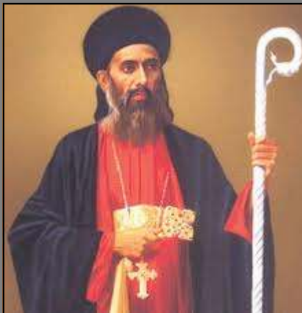
Our Patron Saint Mar Gregorios of Parumala